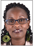
Esther Nyaga Publishing Institute of Africa Kenya